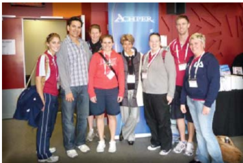
Physical Education majors at Queensland University of Technology